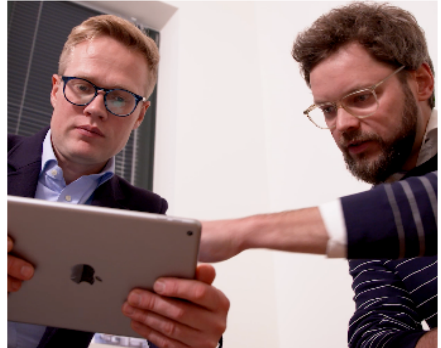
leogistics believes collaboration is key to success in optimizing the supply chain

“We live in an event-driven environment where everything is a resource that has to be moved from location to location,” he says. “Logistics is still seen by many as a cost driver. That will change. In the future, logistics will be a competitive differentiator at every step of the supply chain. We’re seeing it now on the consumer side with Amazon. They deliver fast and within a defined time-frame. That’s all about location.”