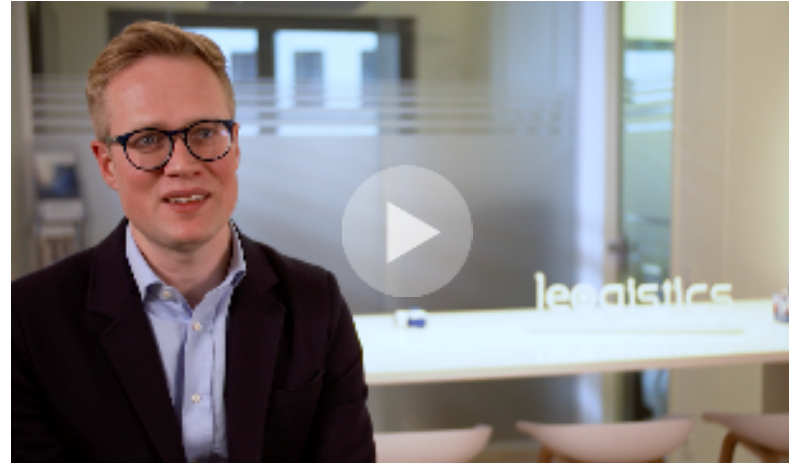
Watch leogistics CEO explain how his company benefits from HERE location technology

Customers needed an integrated, end-to-end solution that provided full transparency of these processes. This meant connecting disparate SAP systems with an end-to-end tracking system – for which leogistics chose to use location technology from HERE.